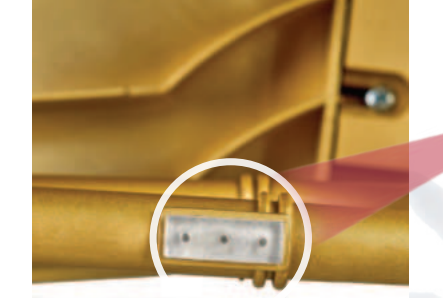
Stack our chairs easily and safely. Our Steel Skeleton chairs include a series of "pads" on the bottom of the lower rung that protects against scratches and chipping when stacking.