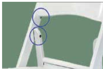
Every detail... Down to the commercial grade aluminum hardware, combining maximum strength with ultra light weight.