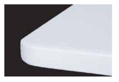
Features rounded edges to prevent your patrons and guests from bumping into sharp corners.