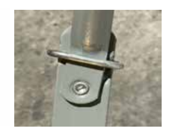
Crafted from heavy-duty powder-coated 18-gauge steel, the frame of this folding table provides exceptional support for laden display stands and full chafing dishes.

18-Gauge Electrostatic powder-coated steel legs