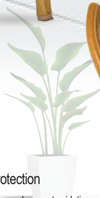
White on Beige