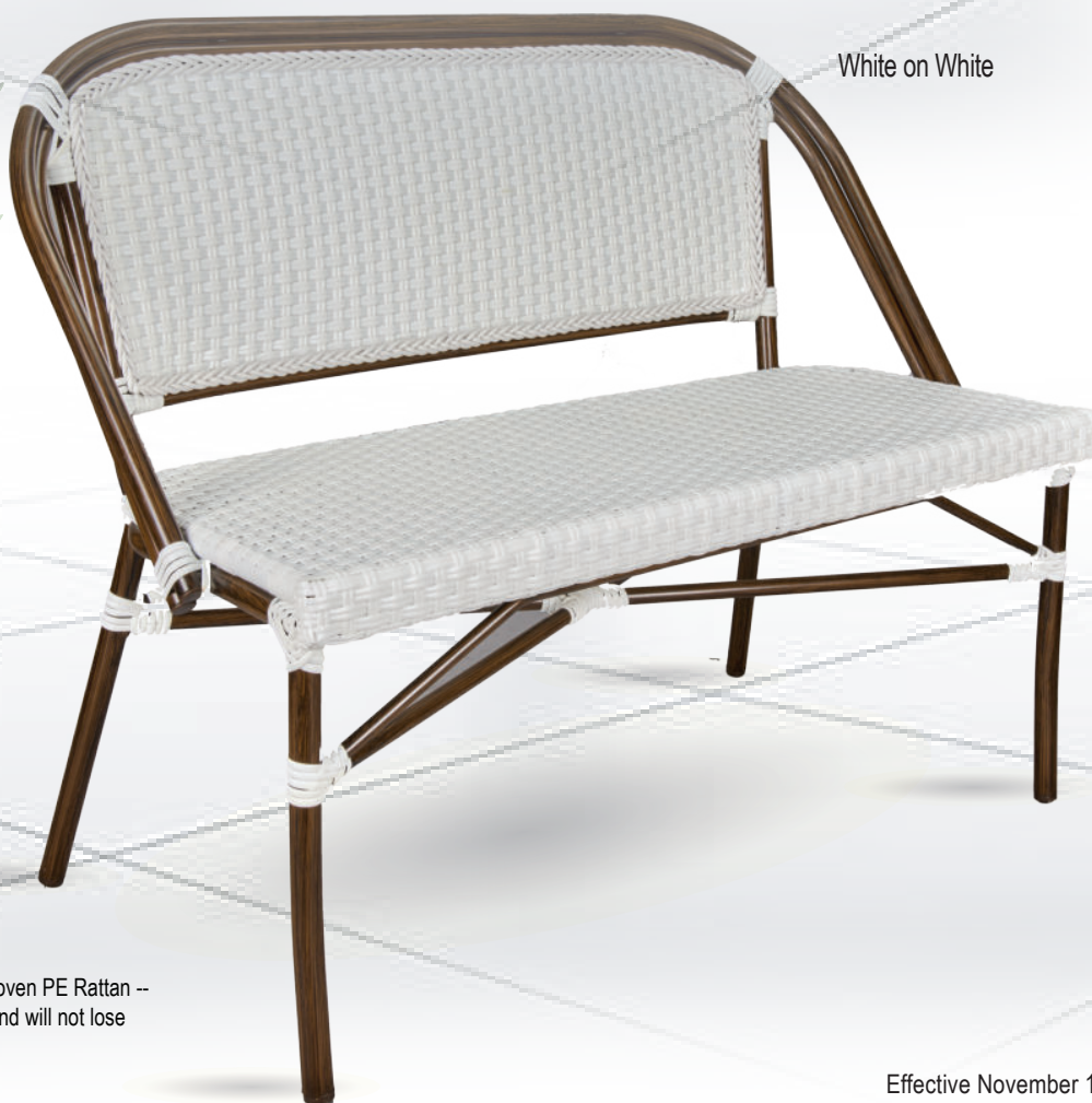
White on White