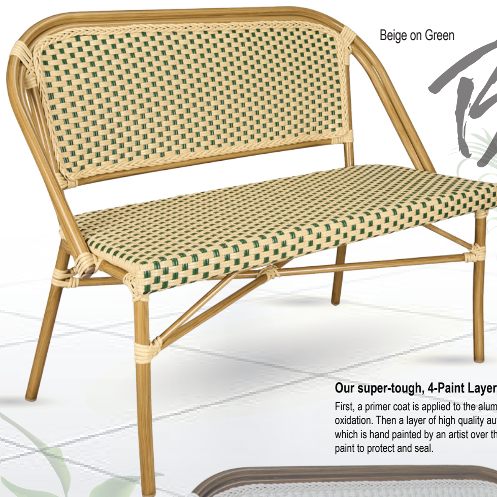
Beige on Green