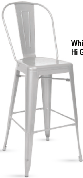
White Hi Gloss