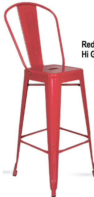
Red Hi Gloss

Our barstools are scratch-resistant and super comfortable, thanks to the curved metal backrest and wide seat.