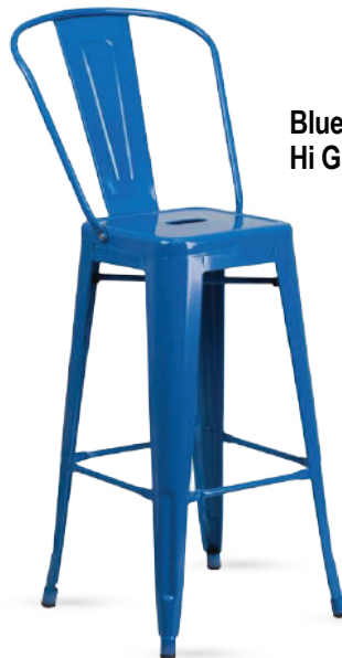
Blue Hi Gloss