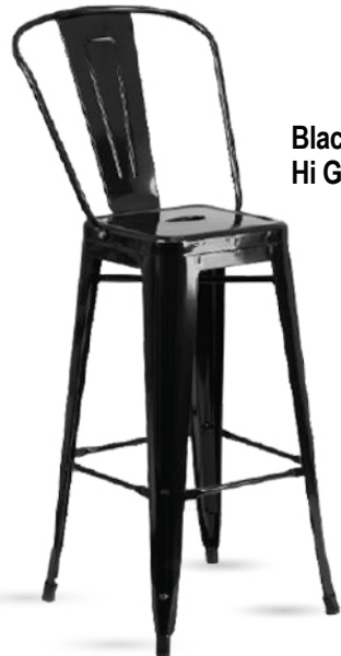
Black Hi Gloss

Made from high-quality sheet metal, our Steelix chairs are designed for all weather use. The original Tolix chair was designed by Xavier Pauchard in 1934 and today our Steelix chairs feature high-quality steel and are precision welded to guarantee the durability needed for the demands of the hospitality environment. Features a 6-step waterproofing process and fitted with rubber feet to protect flooring. Available in a rainbow of colors.