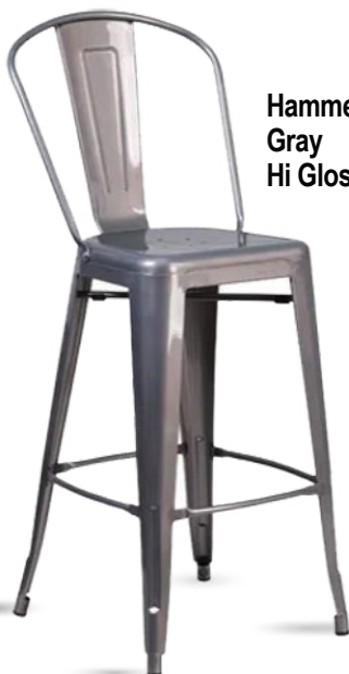
Hammered Gray Hi Gloss