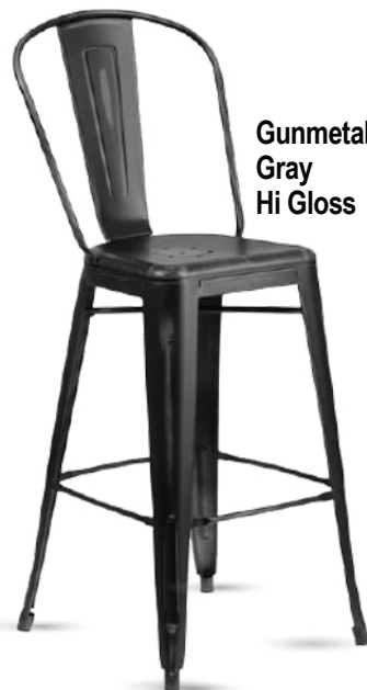
Gunmetal Gray Hi Gloss