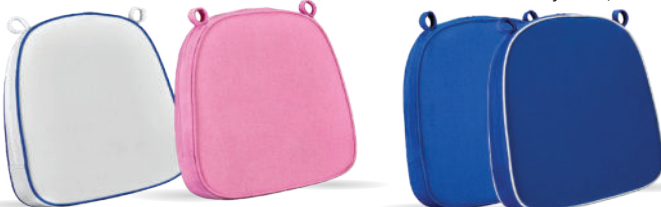
White, Royal Blue Piping