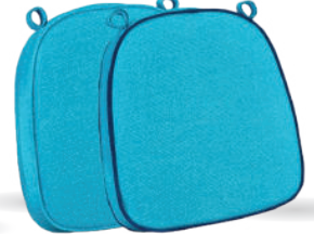
Teal, Navy Piping