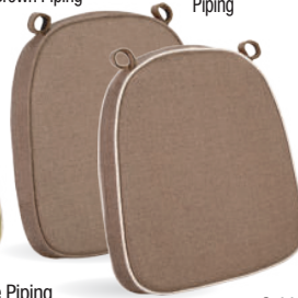
Lt. Brown, Beige Piping