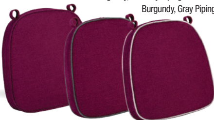
Burgundy, Dk. Gray Piping