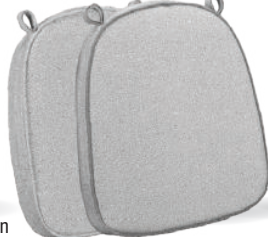
Silver, Silver Piping