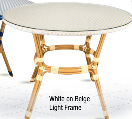
White on Beige Light Frame