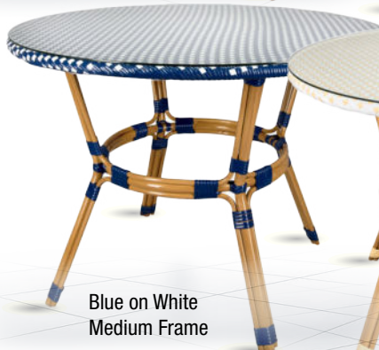
Blue on White Medium Frame