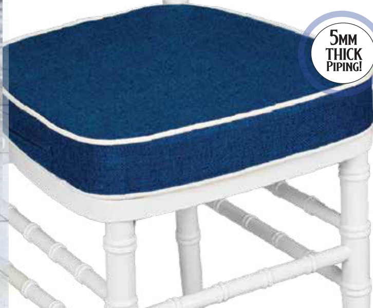
Shown: Royal Blue with White Piping.

Compatible with ALL Chivari plus most regular size (excluding XL seat size) Cross Back, Bentwood, Willow and similar chairs with seat sizes from 15.5" to 16.5".