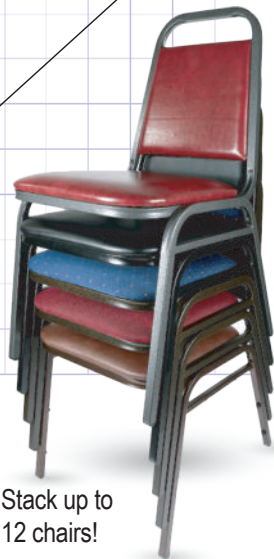
Stack up to 12 chairs!

18-gauge, 7/8" square tubing for unsurpassed stability and comfort.